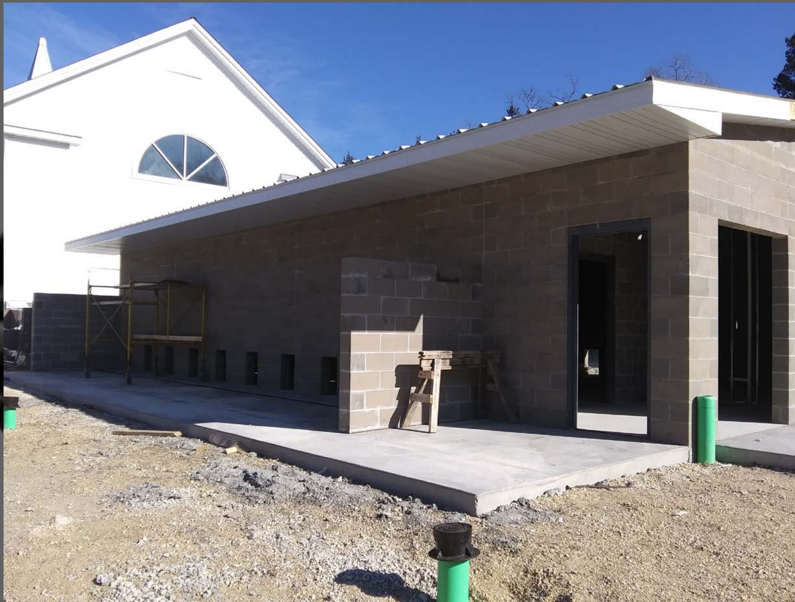
WEST SIDE OF DOG BOARDING ADDITION (SOFFIT AND METAL ROOF RECENTLY INSTALLED)