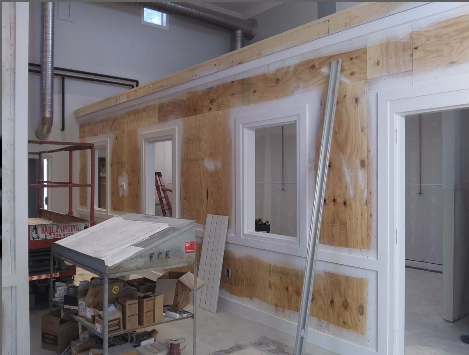
ADOPTABLE DOGS AREA – LEFT HALF (FROM MAIN VIEWING AREA)