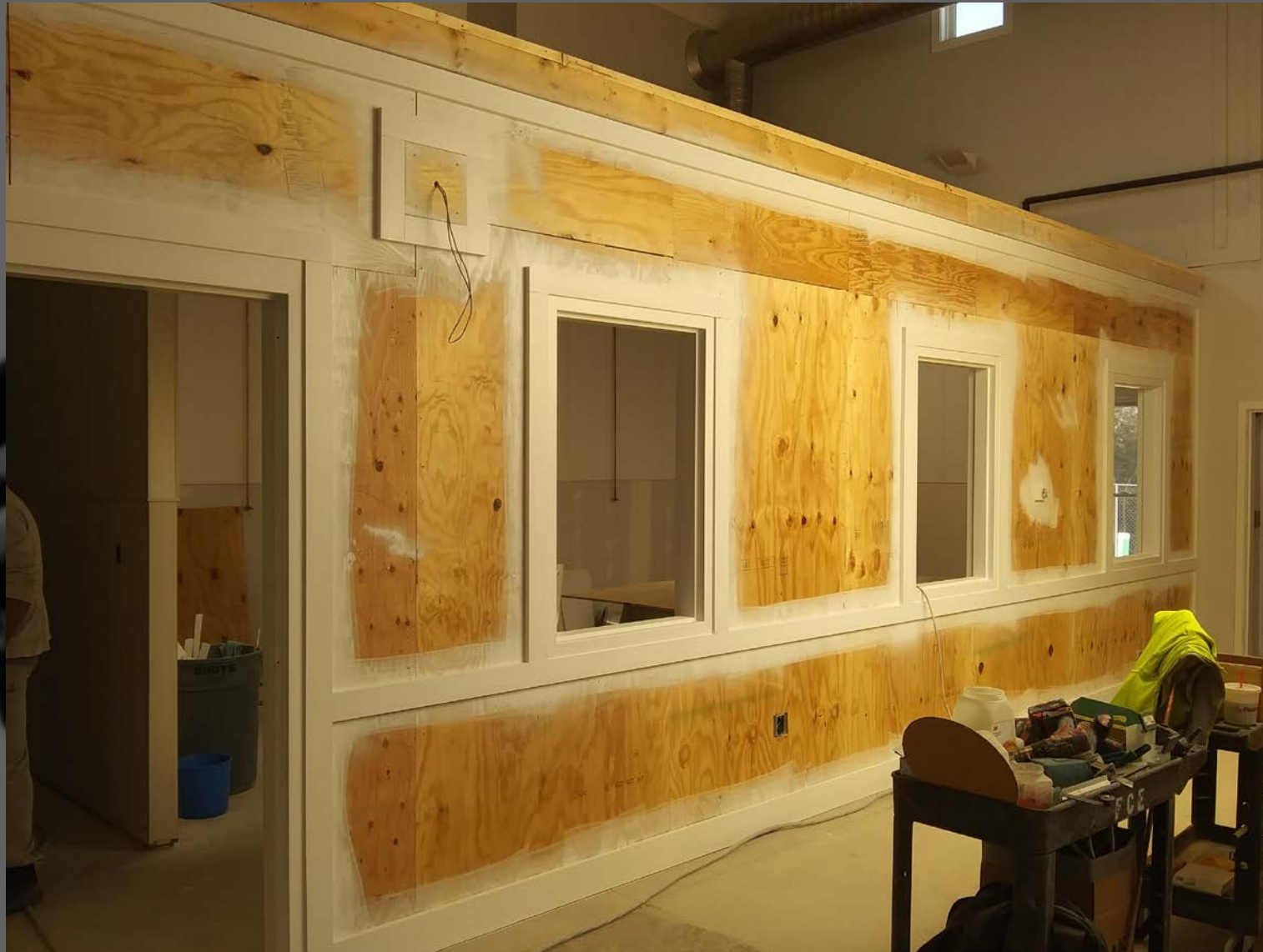
ADOPTABLE DOGS AREA – RIGHT HALF (FROM MAIN VIEWING AREA)