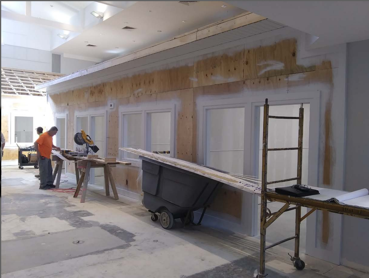
CAT/SMALL ANIMAL ROOMS – RIGHT SIDE (FROM MAIN VIEWING AREA)