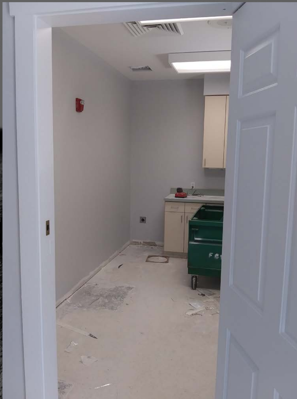
FOOD PREP ROOM