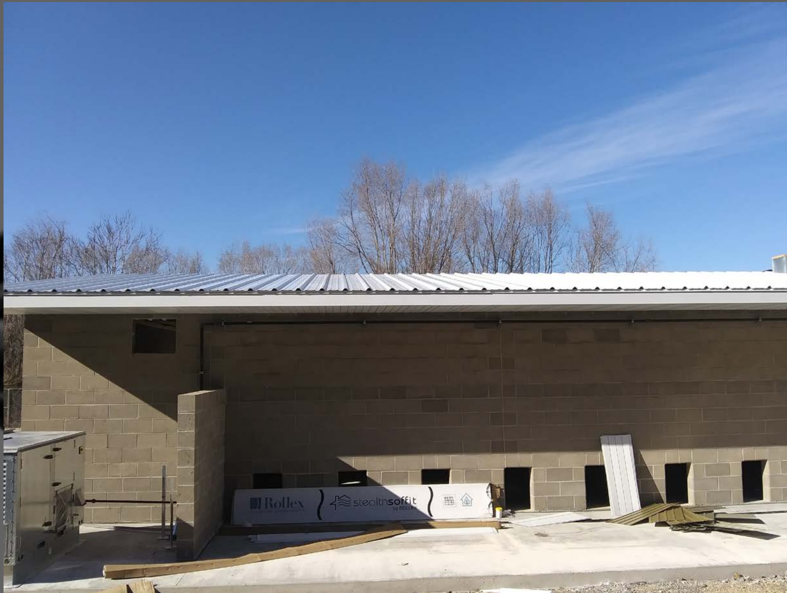
EAST SIDE OF DOG BOARDING ADDITION (SOFFIT AND METAL ROOF RECENTLY INSTALLED)