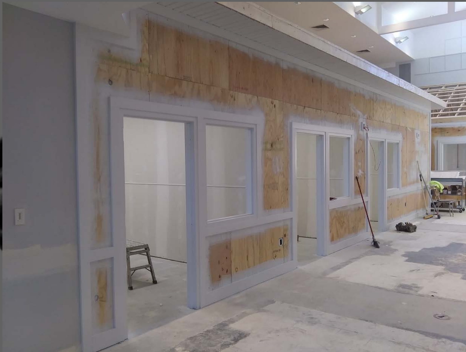
CAT/SMALL ANIMAL ROOMS – LEFT SIDE (FROM MAIN VIEWING AREA)