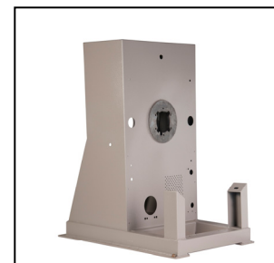
Solid industrial frame

Contact Milnor for your local, authorized dealer: