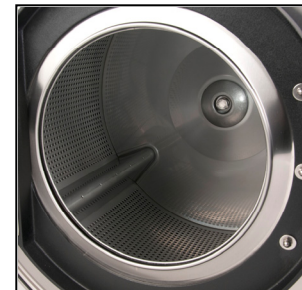
Superior cylinder design