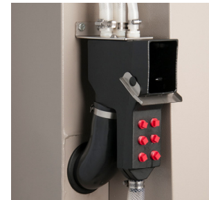
Safe chemical injection